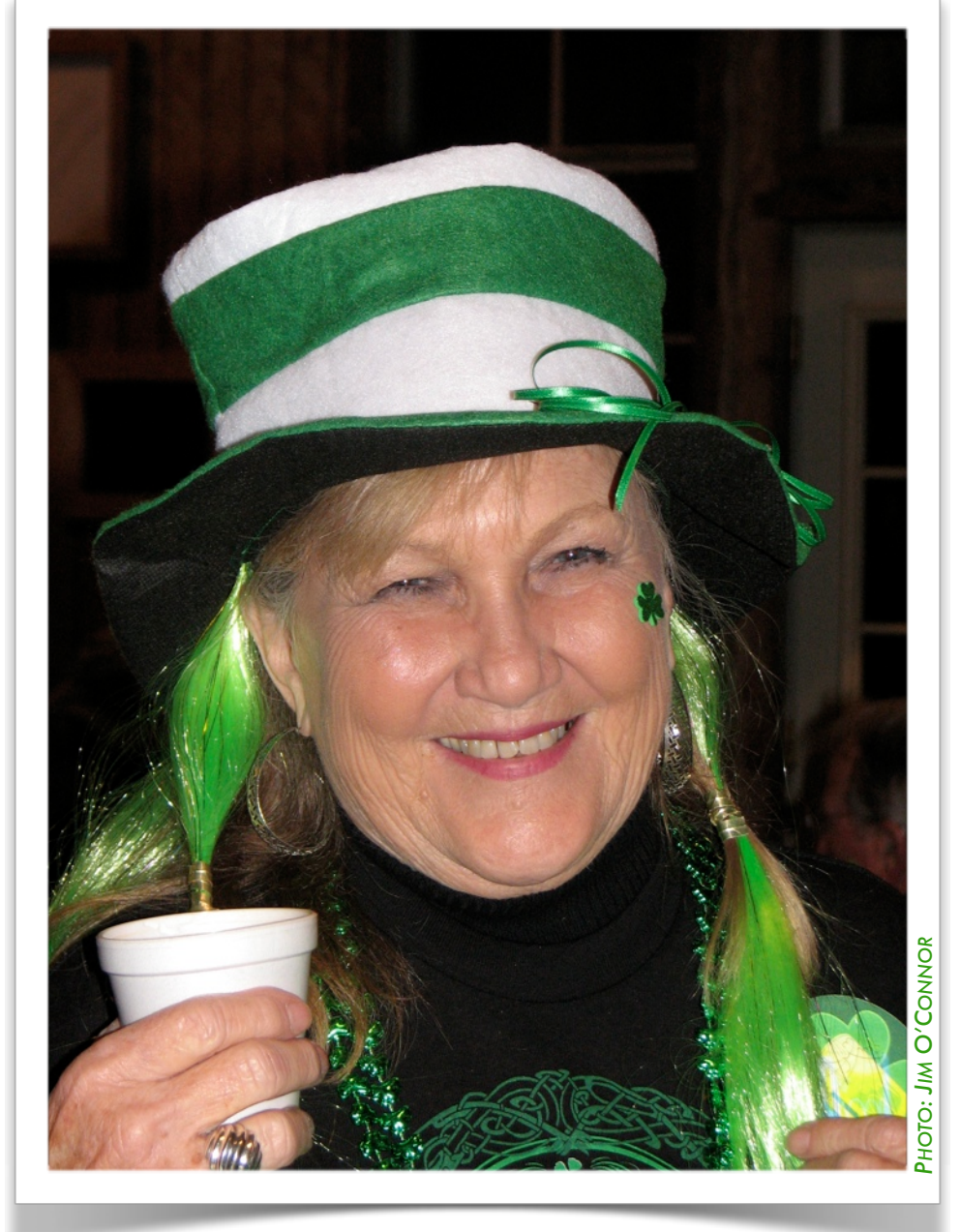
St. Patrick's Day Celebration, Friday, March 13th 2009